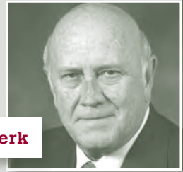
F.W. de Klerk

The Nobel Peace Prize Forum is a premier international event designed to inspire peacemaking. As the Norwegian Nobel Institute's only affiliation outside Norway,