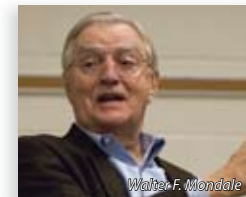
Walter F. Mondale

V.P. 101: Walter Mondale in the classroom